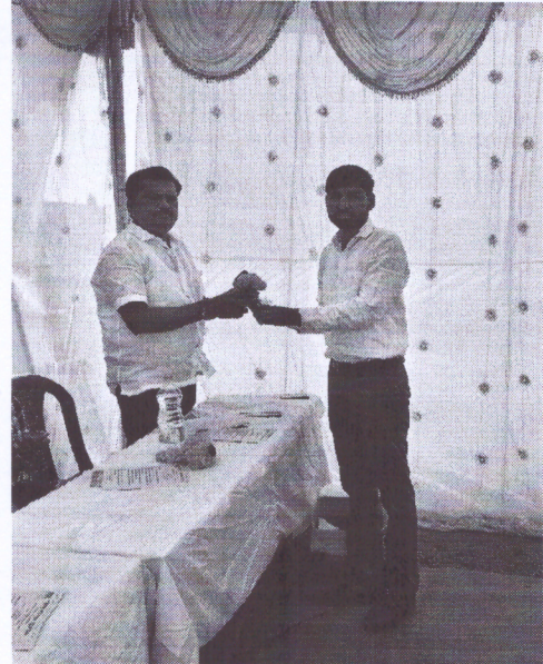
Inauguration/Opening Remarks of Programme